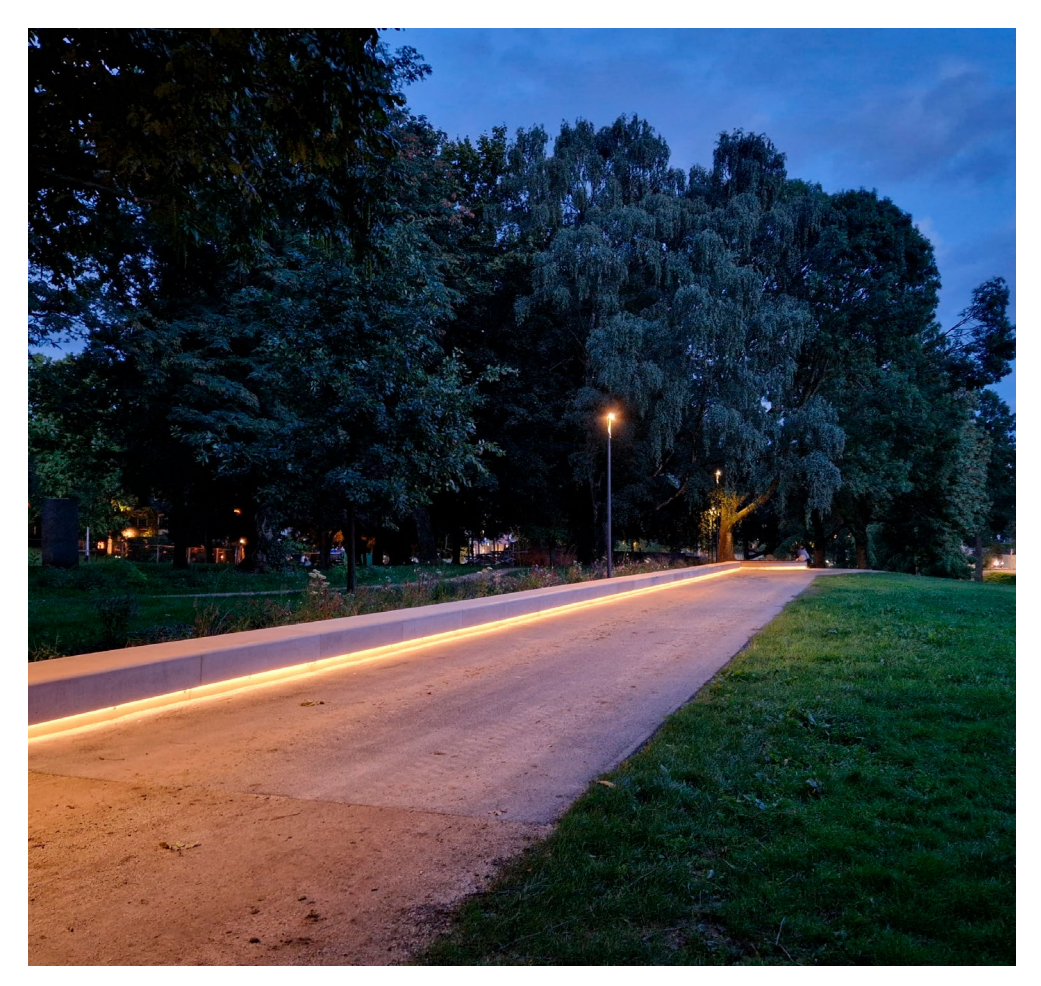
Geropark, Mönchengladbach Opening 09/09/2023