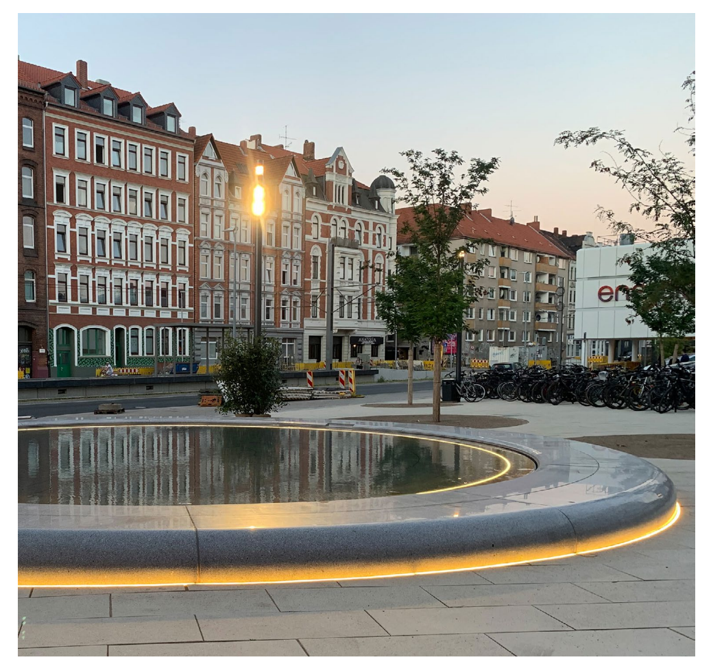
enercity, corporate headquarters, Hannover Opening 07/09/2023

The new building stands on a generous plaza that surrounds the entire building like a carpet. A representative water basin as a sky mirror as well as seating made of polished natural stone cushions form an inviting entrance. A tree grove of picturesquely growing, high crowns provides shade and complements the composition. The project results in a complete upgrade of the urban framework. The competition was won by Haas Cook Zemmrich STUDIO 2050 together with WES LandschaftsArchitektur. WES shareholder Wolfgang Betz was among the guests.