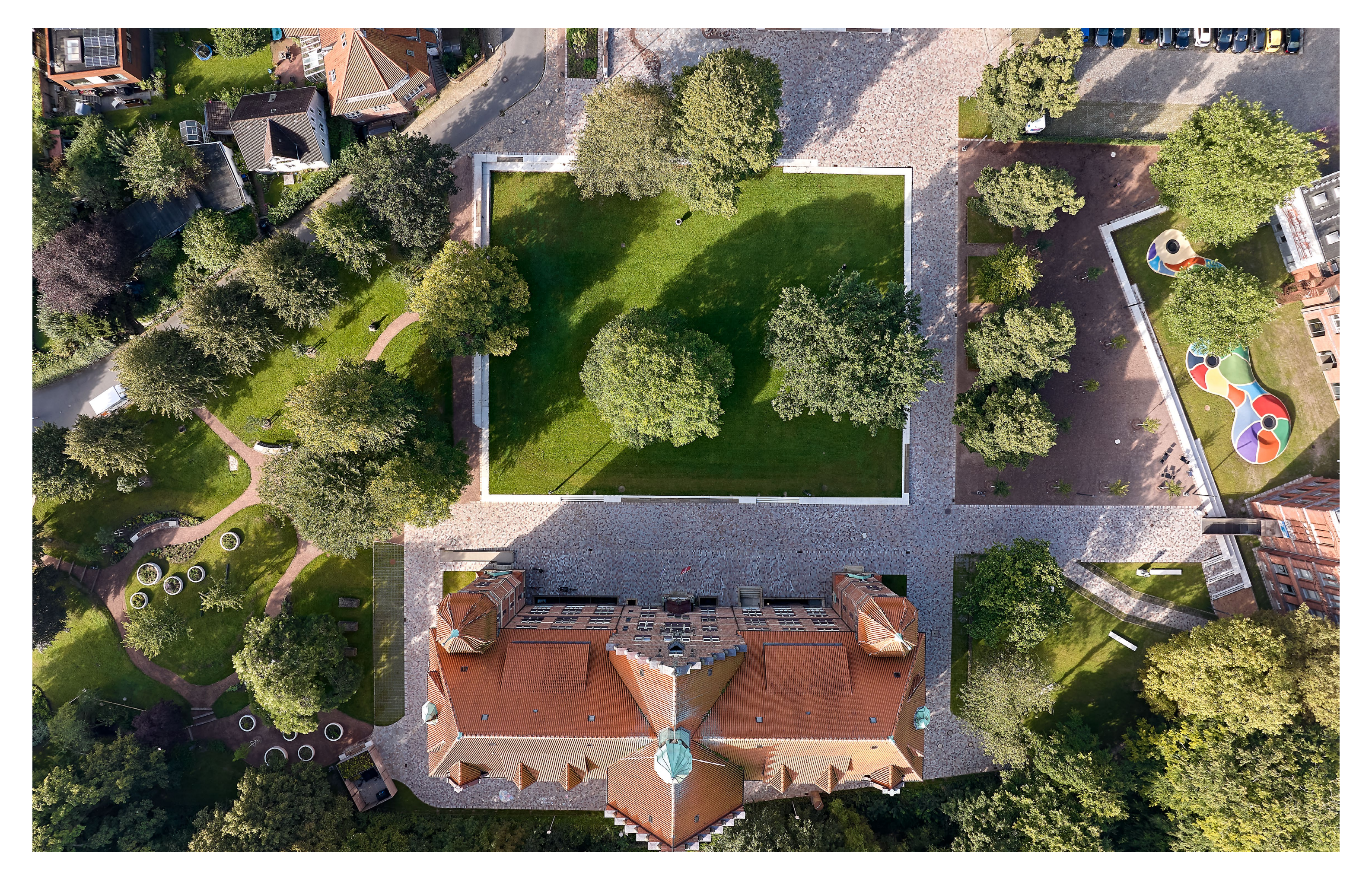
Flensburg Landscape Gardens Opening 10/09/2023