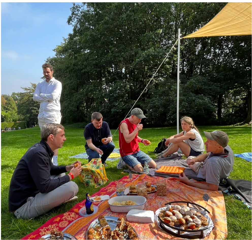
Flensburg Landscape Gardens Opening 10/09/2023